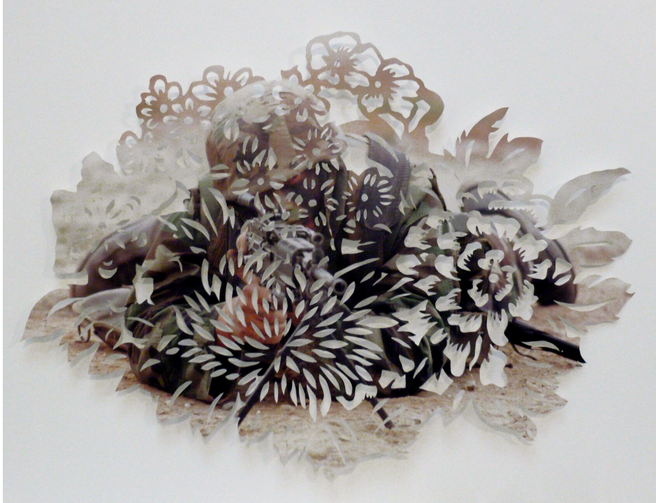
Brigitte Zieger, Flower of Power 8 , military poser cutout, 70 x 55 cm, 2010. With the generous assistance of the artist, © Brigitte Zieger.

In an earlier series entitled Eye Dust (2007-2009), Zieger exploits beauty even more deliberately to denounce the way that dominant representations legitimate violence. Using glitter eye shadow to draw clouds rising from explosions, the series creates a dialectical movement in which what we see (the makeup) hides what is (a face), yet nevertheless sheds light on a form of everyday violence. At the same time, these sumptuously executed images, which gently shine , entice the viewer to become increasingly fascinated with images of violence. Zieger's work, by outrageously exploiting its own aesthetic quality in order to offer a critical perspective on representations and manifestations of military violence, demonstrates by this very token that behind every effort to impose beauty lurks a hidden form of violence. Beauty collaborates with politics, as the very concept of beauty is (in part) political. The challenge of such work lies in the precarious balance between the two.