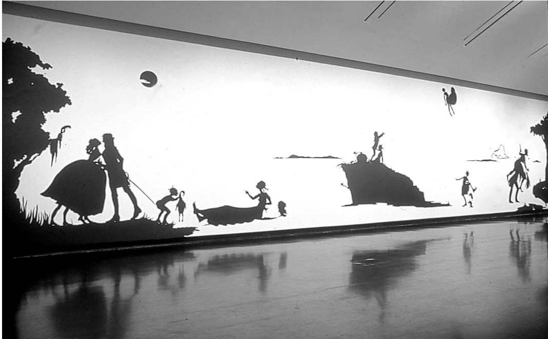
Gone, A Historical Romance of a Civil War as It Occurred between the Dusky Thighs of One Young Negress and Her Heart (1994, cutout paper on a wall, 4 x 15, 2 m)

become complicit, before ultimately becoming conscious of their participation in perpetuating racist and sexist stereotypes.